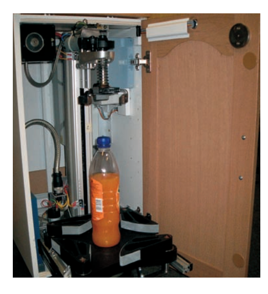
Figure 1. MAGIC-HAND; Left: Computer design drawing of the bottle and jar opening mechanism comprising a base unit, a vertical linear actuator and a top unscrewing unit; Right: The assembled opening mechanism is secured on a sliding tray inside a standard 400 mm wide kitchen unit; The electromagnetic lock is shown at the top-right corner of the door